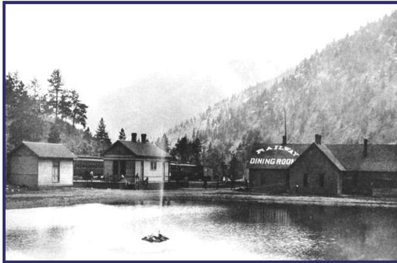
This is a photo of the Colorado Midland depot in Cascade, Colorado. The "Railroad Dining Room" located behind the depot was a Harvey House during the time when the Santa Fe owned the "Midland."

Before the use of dining cars on passenger trains became common around 1900, railroad passengers often had limited choices to find a meal in route. Either they brought their own food or were forced to patronize roadhouses located near the railroad's water stops. Fare was typically nothing more than rancid meat, cold beans, hard bread and week-old coffee.