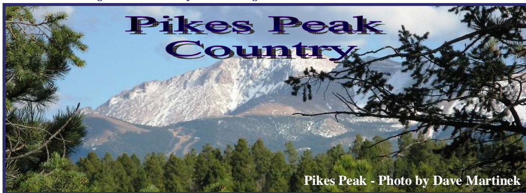
Pikes Peak